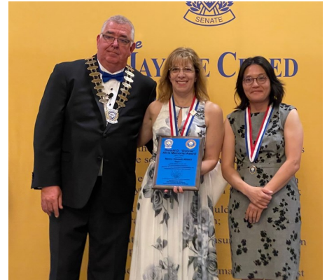
Connecticut and Region One were recipients of recognition